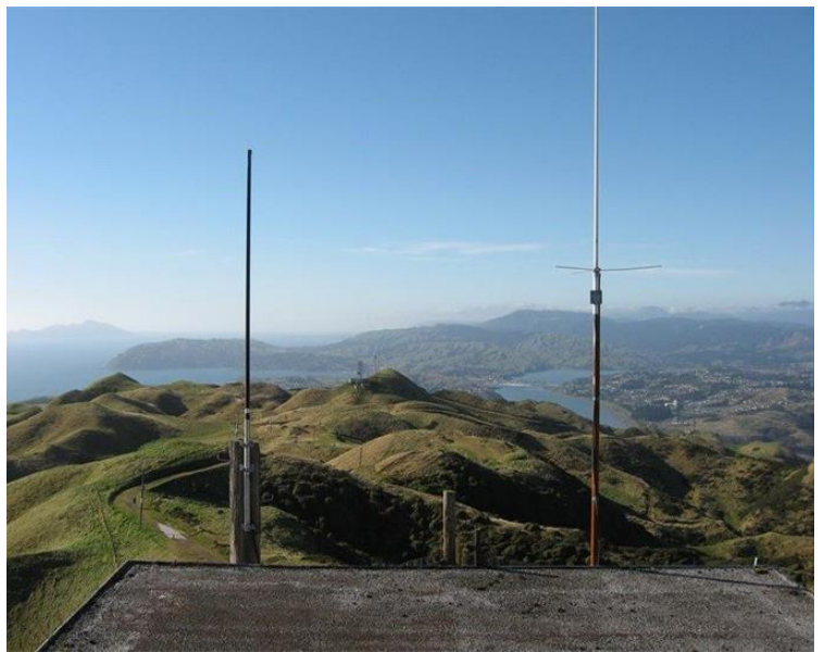
Above: View from Wellington's Colonial Knob EE122 repeater looking north Left: Kaharoa (Whakatane) EE196 repeater Below: Pihanga (Central North Island) EE122