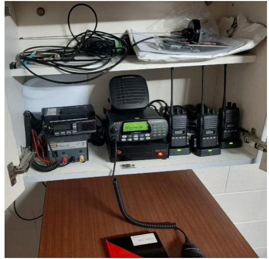
<u>Above</u>: Warkworth CRG radio operating position within the RSA

Mahurangi West CRG covers a remote coastal area South of Warkworth. They are also susceptible to isolation by road, and the area has fragile phone, cellphone, power and internet service. The residents are widely dispersed in a number of coastal bays. The community has a comprehensive emergency plan and the communications team is led by Cluny ZL1MAC and Rob ZL1EMR.