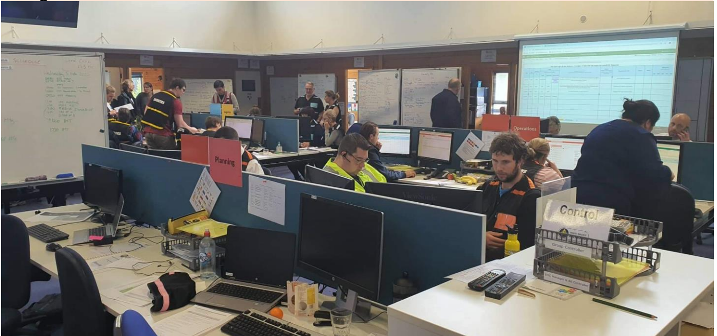
An overview of the Southland Civil Defence Emergency Operations Centre.

In early February, a state of emergency was declared in areas of Southland following the Maitai river flooding. This saw residents from Gore, Wyndham, Riversdale, Maitai and surrounding areas being evacuated.