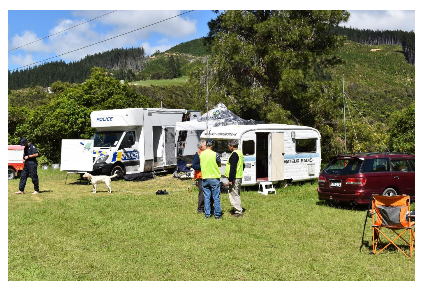
<u>Above</u>: The staging area showing the Mobile Police Base and Upper Hutt Amateur Radio Club's communications caravan.

AREC were responsible for the communications plan. Primary communication was via two portable VHF SAR repeaters and a linking repeater. HF was also used and AREC members kept a watch on local 2M/70cm repeaters for back-channel communications. The SAREX area had limited cellphone coverage so a satellite data link was established to provide Wi-Fi internet coverage.