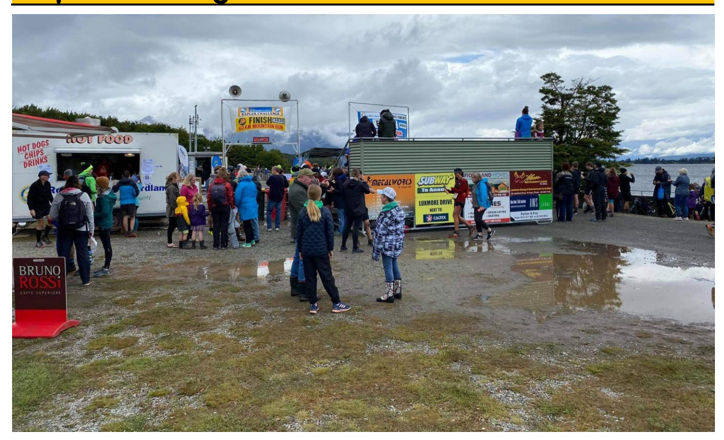
Since 1988, the Kepler Challenge has become an annual event that sees runners complete a 60km course along the circular Kepler Track in the Fiordland National Park. On Saturday the 5<sup>th</sup> of December 2020, Southland AREC provided communications for the event, using both commercial DMR and a portable ESB repeater. AREC used SARTrack to monitor race officials.