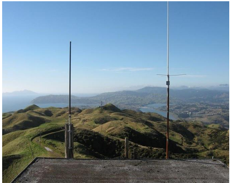
Above: View from Wellington's Colonial Knob EE122 repeater looking north