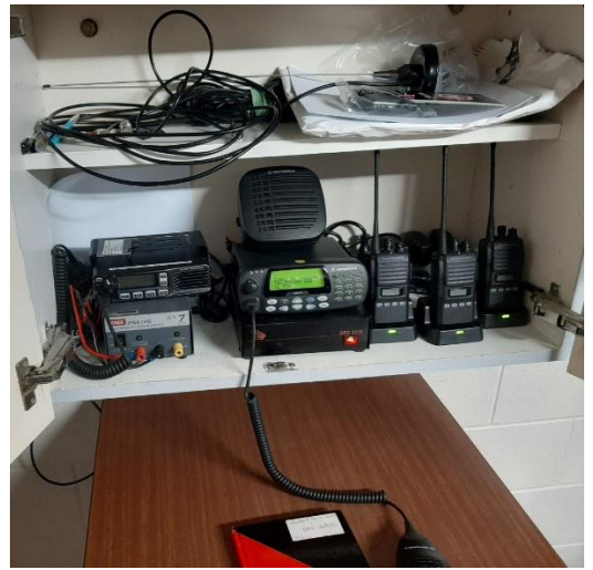
Above: Warkworth CRG radio operating position within the RSA

They operate from a base located in a shed adjacent to the local hall. Power is supplied by a generator and Comms are via the ESB03 repeater on Mt Tamahunga. PRS channel 10 is used to communicate with CRG members in most of the area. The terrain means that a number of the population centres are out of UHF range, and they are currently experimenting with 26MHz CB for local comms and also considering a passive repeater using back to back UHF yagis to assist in getting a signal over a ridge line and into a UHF dead spot. Cluny and Rob also operate 2 metre VHF via the 730 Rodney repeater and VHF simplex.