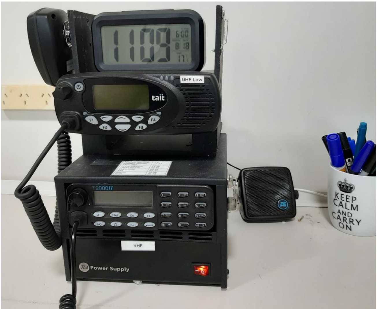
Above: Tait T2020 VHF programmed for local 2metre, CDEM, SAR and Marine VHF. Tait TM8200 UHF programmed for amateur 70 cm, PRS and AEM special purpose UHF channels.