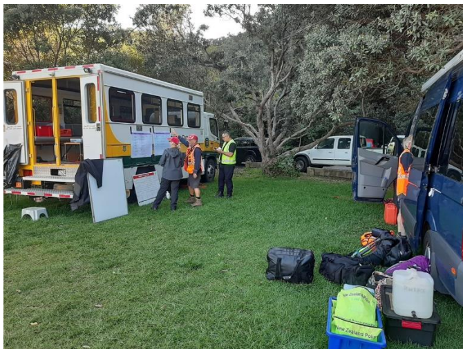
The comms base was set up in the relative luxury of a tramping club bus