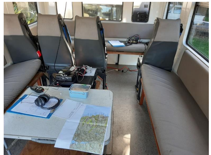
Comfy seats and plenty of room!