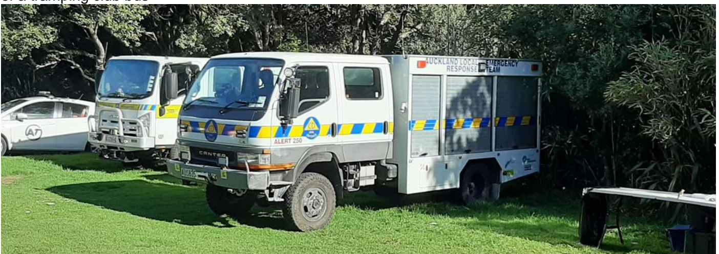
The search included members of NZ Response teams NZRT3 and NZRT5 from Waitakere and North Shore.