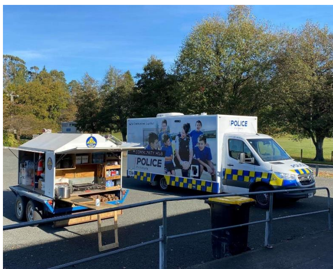
Civil Defence trailer and Police Community Hub.