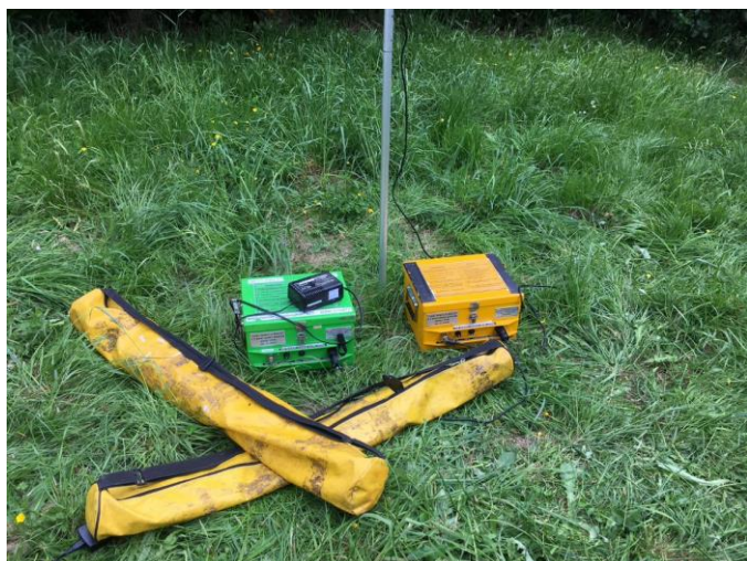
Above: Satellite equipment at Base. Left: SAR portable (yellow) and linking (green) repeaters at the SAREX.

The opportunity was also taken to do field testing of new Police SAR repeaters which were provided by vendors involved in the current procurement. AREC is working with Police and LandSAR to evaluate the responses.