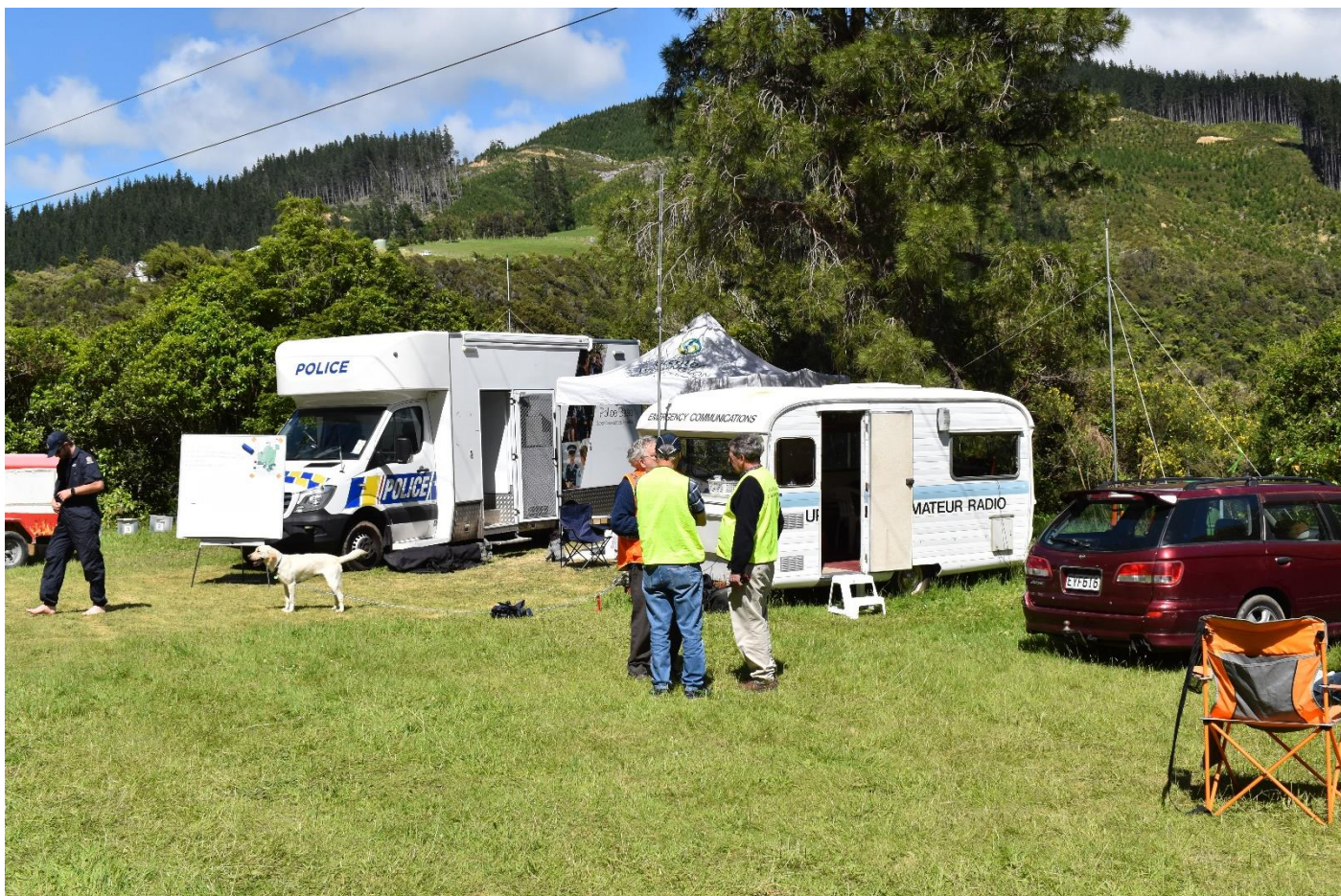
Above: The staging area showing the Mobile Police Base and Upper Hutt Amateur Radio Club's communications caravan.

AREC were responsible for the communications plan. Primary communication was via two portable VHF SAR repeaters and a linking repeater. HF was also used and AREC members kept a watch on local 2M/70cm repeaters for back-channel communications. The SAREX area had limited cellphone coverage so a satellite data link was established to provide Wi-Fi internet coverage.