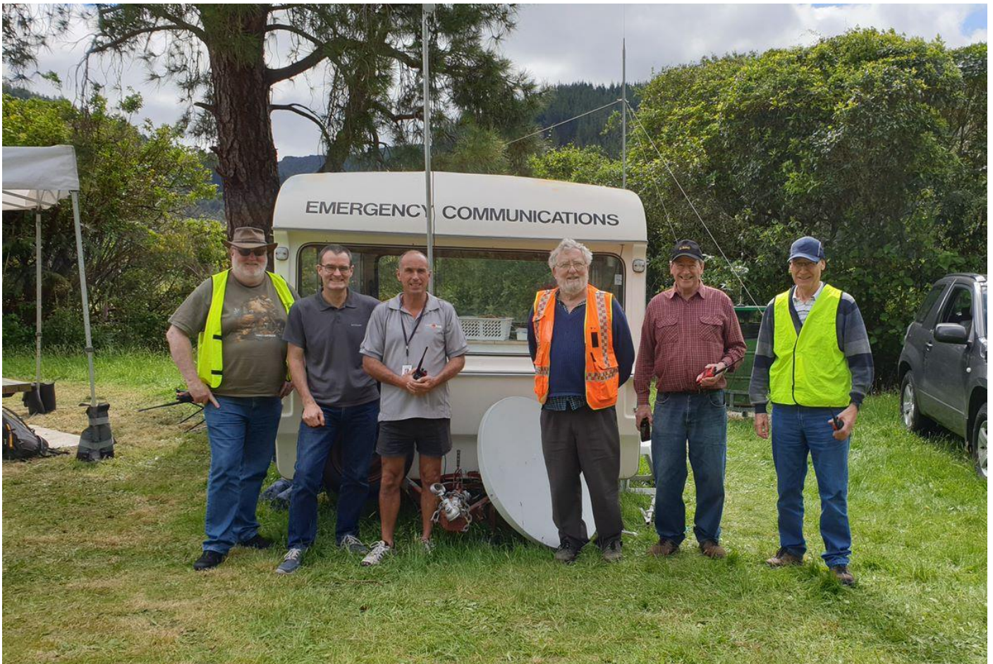
Above: Members of the team take a few moments to reflect on a job well done.